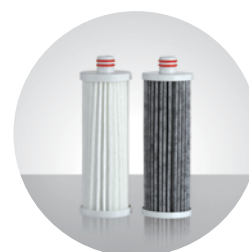
[Water purifier filter]

Achieving all satisfactory results by Korea water purifier standard requirements tests & complies with FDA 21 CFR approvals